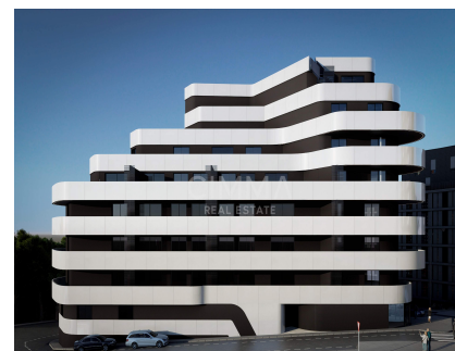
Piscina comunitaria, All exterior, Storage room,