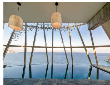
Ascensor, Piscina comunitaria, All exterior,

Last apartment available for €1,100,000. Contact us!