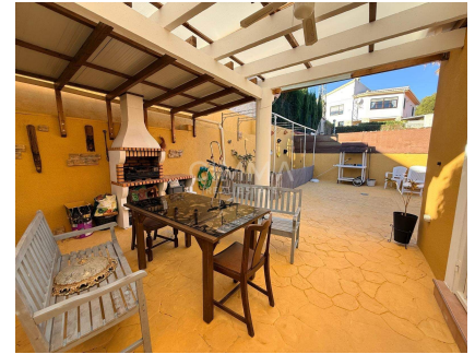
Built-in wardrobes, Balcón, Garden, Terrace, All exterior, Storage room,

128 m 2 townhouse on a 315 m 2 plot, located in the quiet Les Masies urbanization, just 5 minutes from the center of La Nucía and all its services. The house features an independent kitchen with access to the garden and a laundry room, a guest toilet, and a bright living-dining room with large windows and direct access to the covered barbecue area. On the first floor, there are 3 bedrooms with fitted wardrobes, 2 full bathrooms (one en-suite), and a private balcony in the master bedroom with partial sea views. The basement offers a multi-purpose room ideal as a storage room, gym, or leisure area. Outside, there is a large barbecue area with a summer dining room, a vegetable garden, a large patio-solarium, a low-maintenance garden with the possibility of building a pool, and private parking for 3 vehicles. The northeast-facing property offers open views of the mountains, ceiling fans, and has been recently renovated in 2024 with interior and exterior waterproofing, being in perfect condition to move in. Its location offers excellent communication, with quick access to the N-332 and the AP-7, as well as bus and TRAM connections to Benidorm, Alicante, and Valencia, and proximity to the airports of Alicante (61 km) and Valencia (157 km). An ideal opportunity for those seeking tranquility, outdoor space, and a home ready to enjoy.