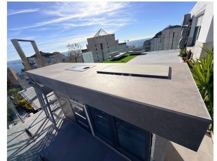
Ascensor, Heating, All exterior,

Don't miss this unique opportunity! This spectacular penthouse won't be available for long.